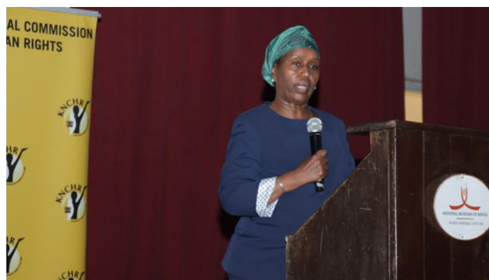
KNCHR Commissioner Hon. Sarah Bonaya during the celebration of Human rights day on 10th Dec 2024 in Nairobi County

At the NCIC's exhibition booth, the Commission showcased her ongoing initiatives aimed at supporting women educators. The booth became a hub for knowledge-sharing, featuring materials focused on peacebuilding, reconciliation, and promoting gender equality.