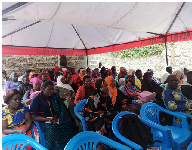
Women Participants during the meeting on 29th Nov 2024 in Nakuru County.

On November 29, 2024, the NCIC Central Rift team, in partnership with the Kenya Muslim Youth Development Organization (KMYDO), held a dialogue in Nakuru on peace and gender-based violence. The event brought together women participants to raise awareness on peacebuilding, combating gender-based violence, and addressing mental health challenges.