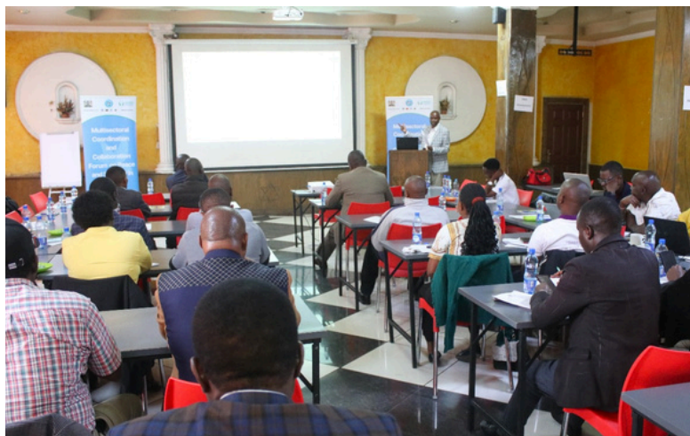
Participants following proceedings during the Multisectoral the meeting on 27th Nov 2024.

On November 27, 2024, the NCIC Central Rift team participated in a workshop facilitated by Midrift Hurinet at Waterbuck Hotel to establish a multi-sectoral forum on peace and security for Nakuru County. The event, held in response to a circular issued by the Principal Secretary of the Ministry of Interior and National Administration, brought together government representatives, security agencies, civil society, religious leaders, and community groups to address security challenges, enhance information sharing, and promote cohesion.