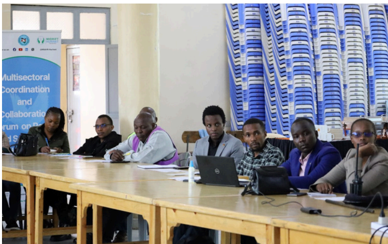
Participants during the Nakuru East Sub-County Multisectoral meeting on 4th Dec 2024 in Nakuru County.

The session aimed to empower women as agents of change, foster community cohesion, and equip participants with tools to address these issues effectively. Key outcomes included an enhanced understanding of gender-based violence and mental health, commitments to community advocacy, and strengthened collaboration between stakeholders. Through addressing deeply rooted cultural perceptions, the event highlighted the importance of sustained engagement to build resilient communities.