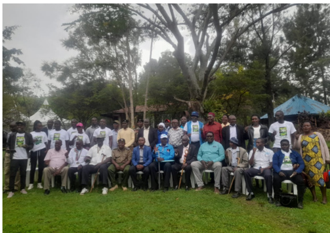
Participants during a stakeholder meeting on 13th Nov 2024 in Nyanza County.