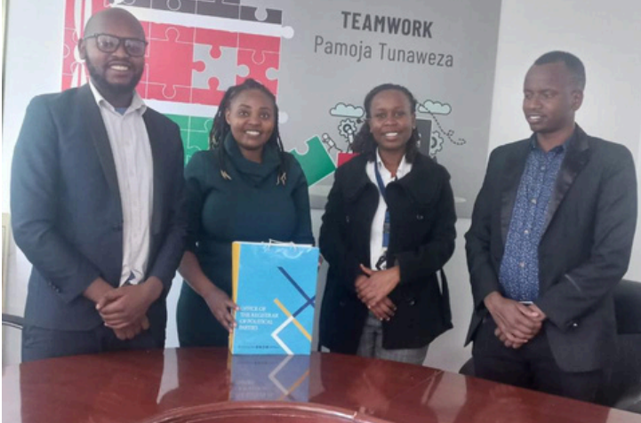
NCIC Metropolitan & Lower Eastern Region team during their meeting with ORPP officer at the NCIC HQ on 12th December, 2024.